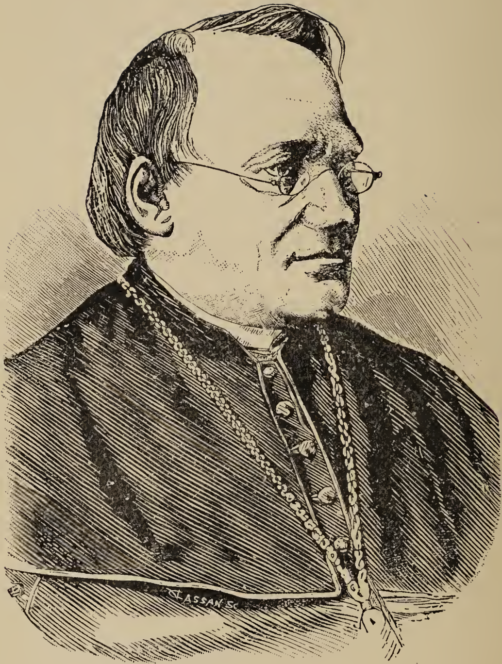
HIS GRACE MGR. ALEXANDRE ANTONIN TACHÉ.